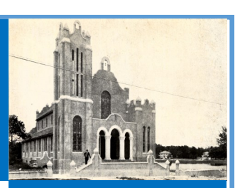
A CENTURY OF COMMUNITY IN CHRIST