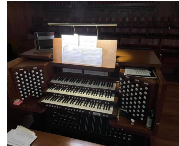
Park Lake’s current Organ

The original 1925 church organ was a 13 rank instrument, installed by the Pilcher Organ Company. Each rank had 61 pipes, so the organ system included 793 pipes made of metal and wood. In the 1970s, another 32 ranks (1952 pipes) were added. Later updates included purchasing a digital organ and connecting it to the pipe organ. Maintenance is ongoing.