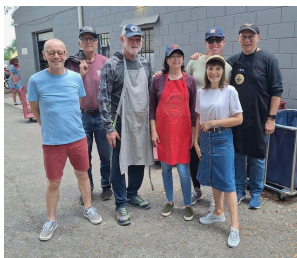
Thank you to April and May volunteers!